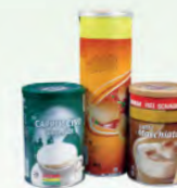
Cappuccino cans, crisps packaging, cardboard or plastic packaging etc.