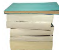
Books without laminated covers