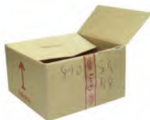
Cardboard packaging (ripped to shreds only)