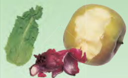
Salad, fruit and vegetable waste