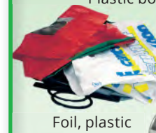
Foil, plastic carrier bags