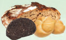
Stale bread / stale bread rolls